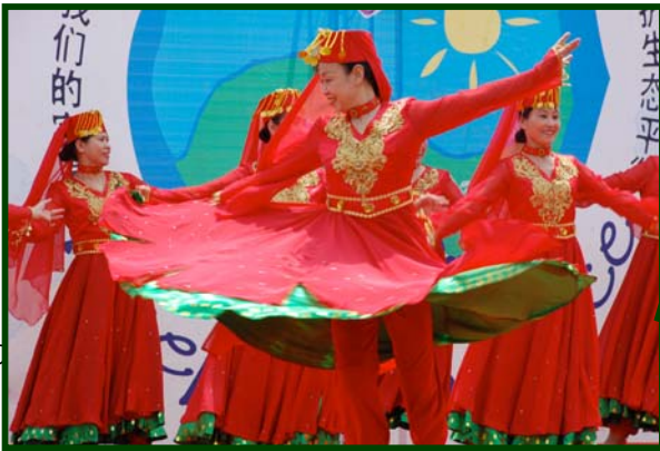
Minority dancers wowed the crowd at Earth Day