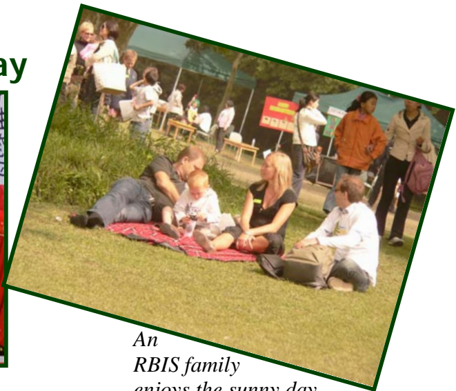
An RBIS family enjoys the sunny day.